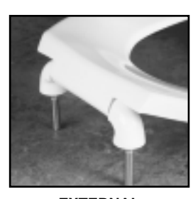
EXTERNAL CHECK HINGE